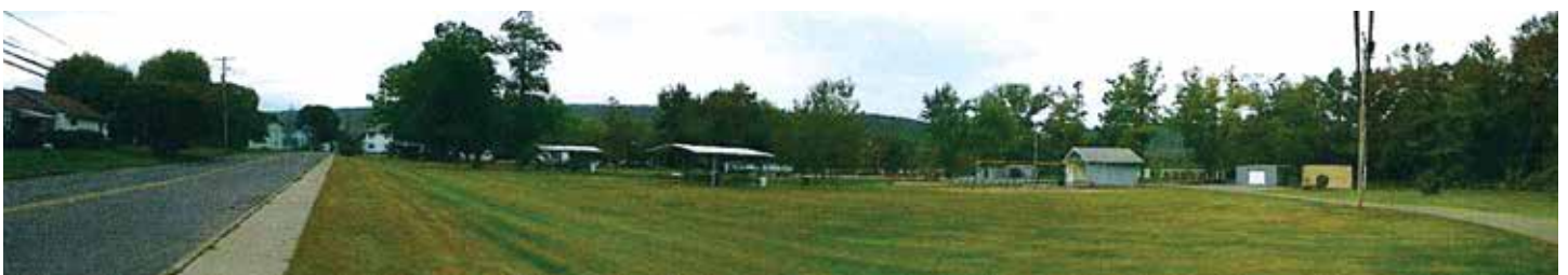
View from East 3rd Street into Wind Gap Park

Security Deposits apply for all Organizations