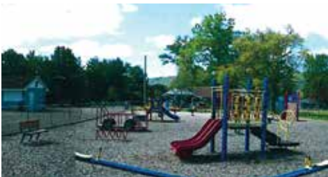
Recently improved play area