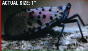
Adult (with wings closed) can be found July-December PA Department of Agriculture