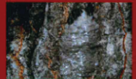
Egg mass (fresh) can be found September-December PA Department of Agriculture