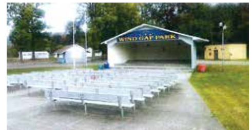
Amphitheater stage and seating