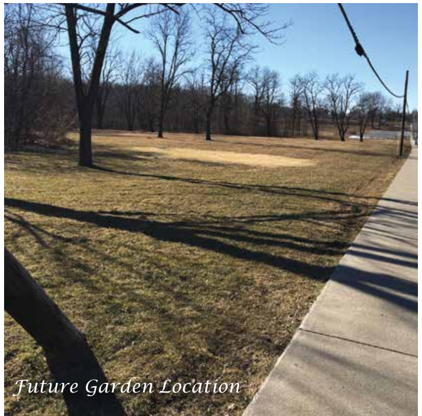
Future Garden Location