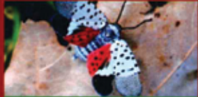
Adult (with wings open) can be found July-December PA Department of Agriculture