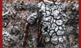
Egg mass (older) can be found January-June PA Department of Agriculture

This publication is available in alternative media on request.