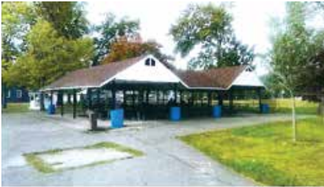
Large pavilions next to the baseball and soccer field