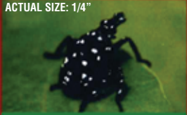
Nymph (early stage) can be found late April-July PA Department of Agriculture

THIS INVASIVE INSECT POSES A SIGNIFICANT THREAT to Pennsylvania agriculture, including the grape, tree fruit, hardwood, and nursery industries, which are collectively worth nearly $18 billion to the state's economy.