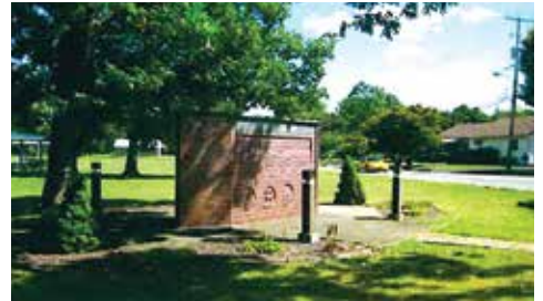
Memorial wall at entrance from East 3rd Street