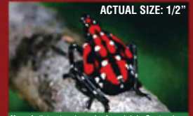
Nymph (late stage) can be found July-September PA Department of Agriculture